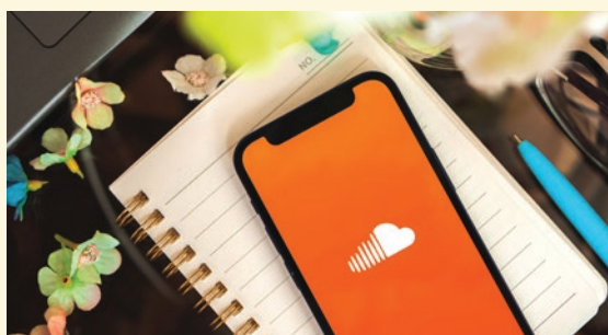
CRICKET eLEARNING ON SOUNDCLOUD